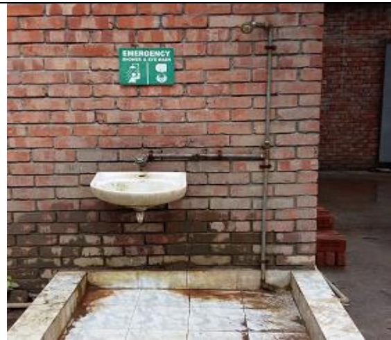
Eye Wash & Shower facility