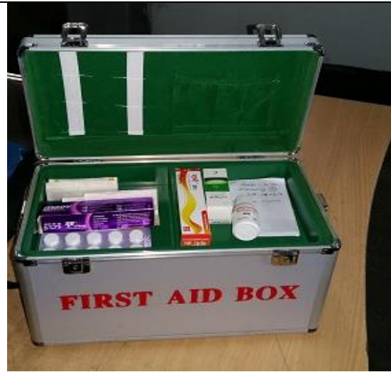
First Aid Box