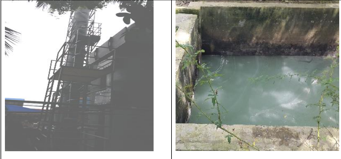
ATP & ETP at RIMSO