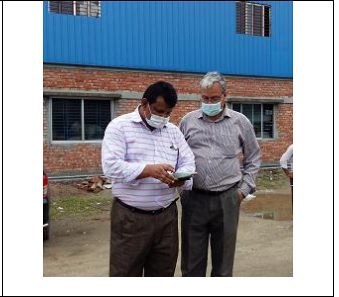
Photograph: pH, TDS and noise testing by IDCOL at RIMSO