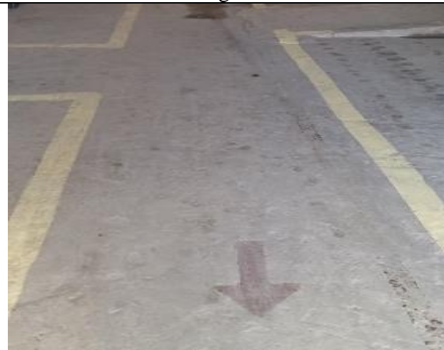
Aisles arrangement at RIMSO