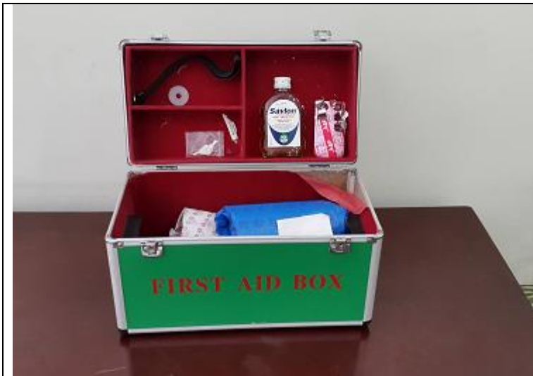
Photograph : First Aid Box