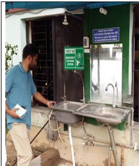
Photograph: Emergency Eye wash