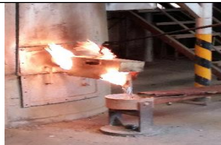
Photograph : Furnace Safety Guard with Rotary Pot