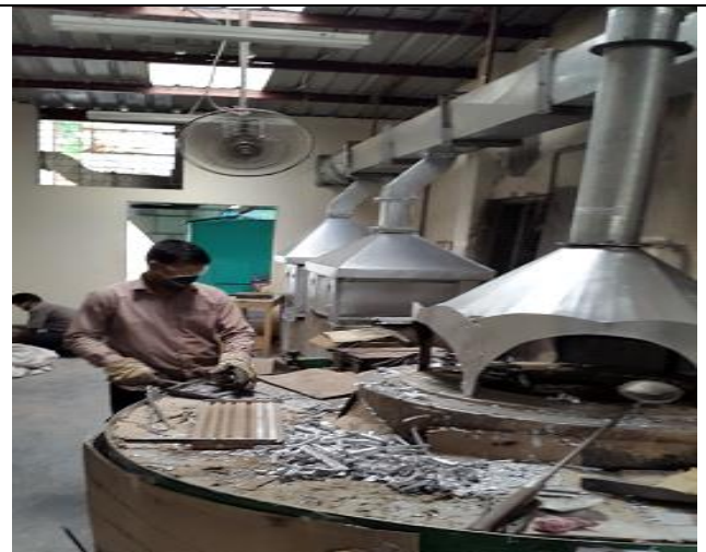
Photograph: Alloy melting area