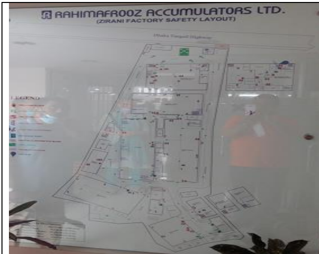
Photograph: Factory Safety Layout