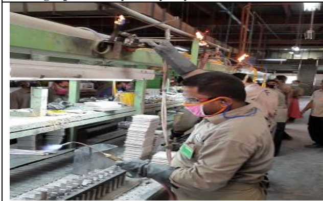
Photograph : A view of welding section