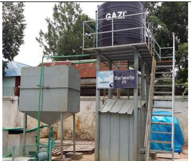
Photograph: New ETP to neutralize acid wastewater.