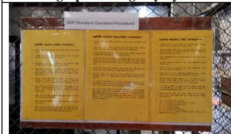
Photograph : SOP at Rotary area