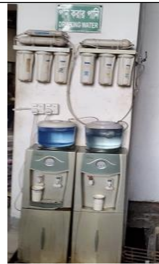
Photograph : RO drinking water technology