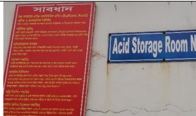
Photograph : MSDS at Acid Storage area