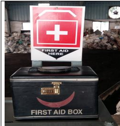
Photograph: Emergency Eye wash