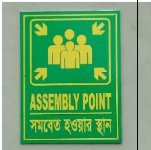
Photograph : Assembly area