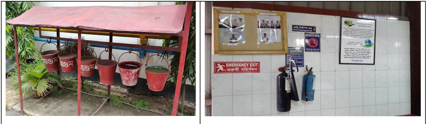
Photograph : Firefighting arrangement