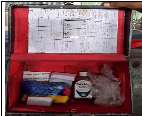
First Aid Box