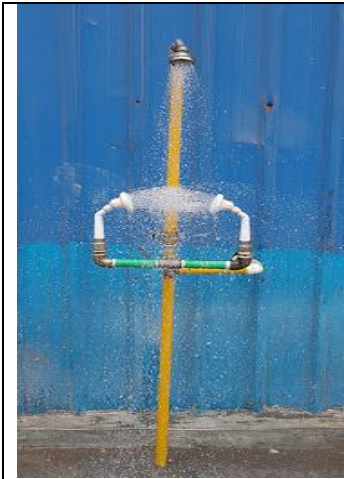
Eye & Shower