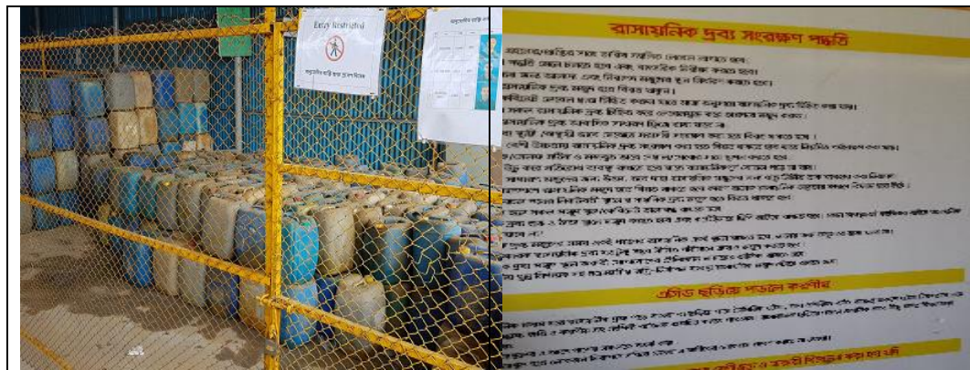
Acid Storage area with MSDS