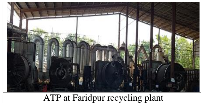
ATP at Faridpur recycling plant