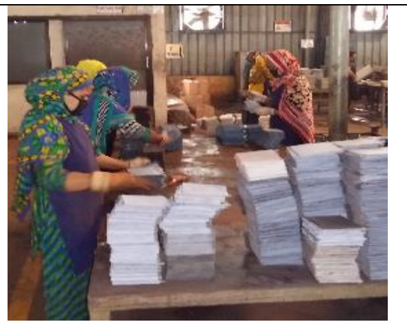
Application of PPE