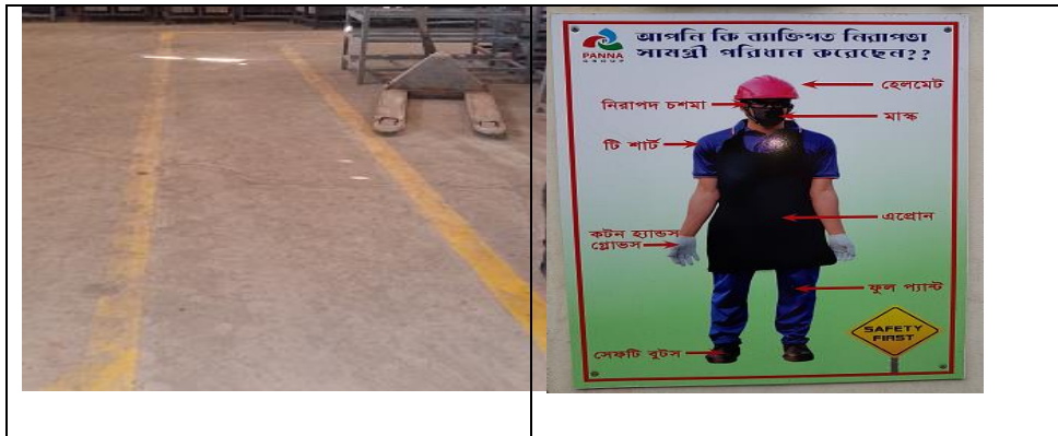
Photograph: Aisles & Safety Sign