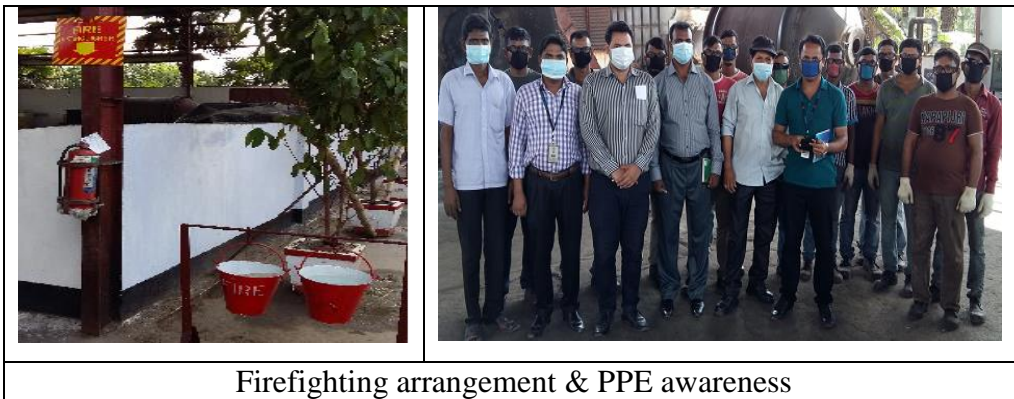
Firefighting arrangement & PPE awareness