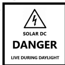
Figure 2: Sample sign for live parts.