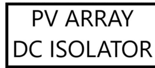
Figure 3: Sample sign required adjacent to PV array D.C. isolator / switch-disconnector

and the need to turn off all switch disconnectors to safely isolate equipment. Sample signage is shown in Figure 3 and 4.