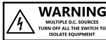
Figure 4: Sample sign required where multiple isolator / switch-disconnector devices are used

19.8. Central shutdown system must be indicated by sign such as shown in Figure 5.